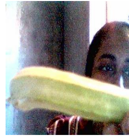
Before Okra crop turning white

Pictures sent to experts at Madurai Agricultural College: diagnosed as "Yellow Mosaic disease"